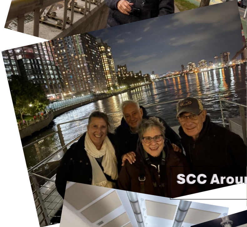
SCC Around Town